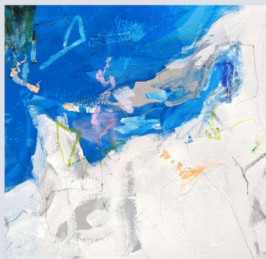
'Botallack' 2021 Mixed-media on paper 21cm x 19.5cm

Hayle Heritage Centre 24 Foundry Square, Hayle